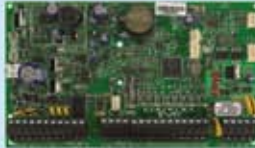
EVO48 8- to 48-Zone Control Panel