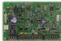
DGP-ACM12 4-Wire Access Control Module