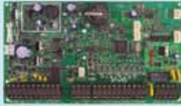
EVO192 8- to 192-Zone Control Panel